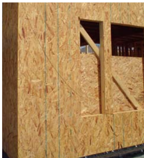
Sheathing Installed To Resist Combined Shear and Uplift

The ICC 600 and SDPWS contain specific design and installation detailing requirements for using this technique. Since a single system is being used to provide two important load paths, it is critical that these detailing requirements be strictly followed. These non-traditional detailing requirements will require more time on the part of both the installer and the inspector.