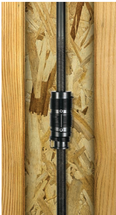
The new Coupling Take-Up Device utilizes fewer parts, thereby streamlining installation and reducing labor costs

The Simpson Strong-Tie® Anchor Tiedown System for Multi-Story Overturning Restraint catalog (C-ATS) puts all the product and design information right at your fingertips, including technical information, multi-story rod system design concepts and schematics for runs up to five stories. Visit www.strongtie.com to download or request a copy or call (800) 999-5099.