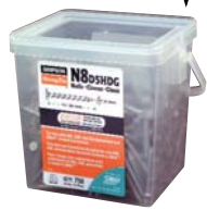
Hot Dipped Galvanized nails are available in 1 lb. and 5 lb. plastic tubs for easy handling.

Catalog C-11105 © Copyright 2005 SIMPSON STRONG-TIE COMPANY INC.