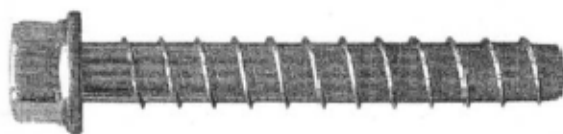
FIGURE 1—TYPICAL TITEN HD SCREW ANCHOR

Titen HD screw anchor packaging is marked with the Simpson Strong-Tie Company name; product name (Titen HD); anchor diameter and length; the name or logo of the inspection agency (CEL Consulting); and the evaluation report number (ESR-1056). In addition, the ≠ symbol and anchor length (in inches) is stamped on the head of each screw anchor.