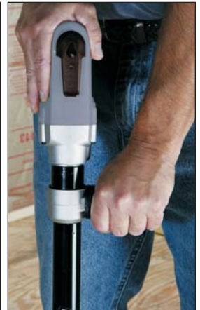
Adjust the handle for your driving comfort