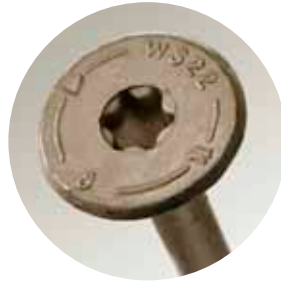
The 6-lobe drive prevents cam-out and head stripping.