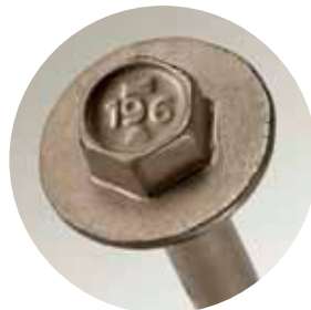
Hex-washer head provides excellent bearing area.